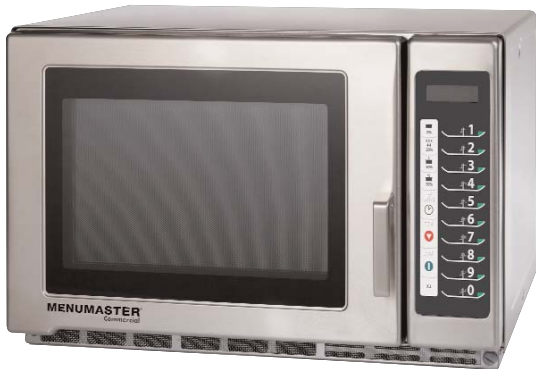
Model RFS518TS shown